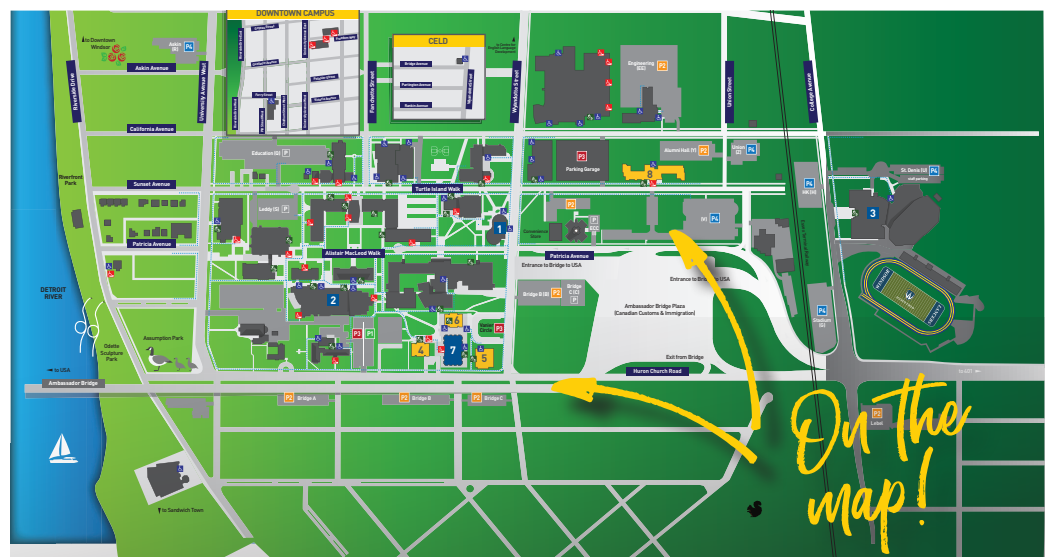
1 Welcome Centre 2 CAW Student Centre 3 St. Denis Centre & Forge Fitness Centre